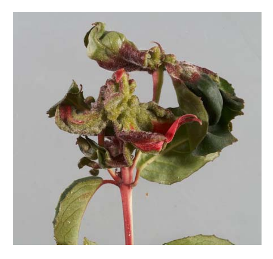
Figure 1. Gross shoot tip distortion in Fuchsia sp. infested with Aculops fuchsiae Keifer the Fuchsia gall mite.